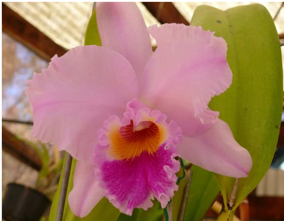
Blc. Mulgrave Bells