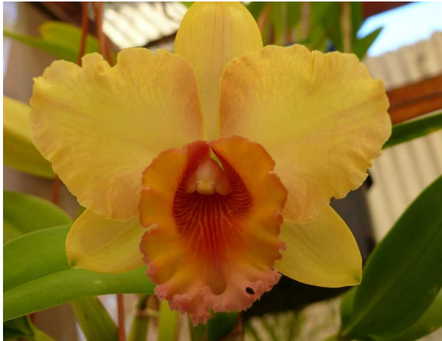
Blc. Mt Isa 'Jean x Pot. Beaufort Gold "No.!"