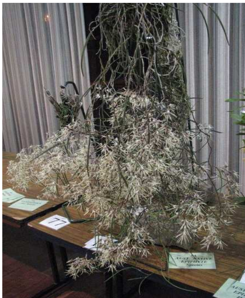
Dendrobium teretefolium var. aureum