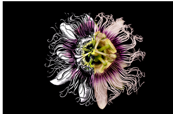
A postcard image

The details: Anthropomoflora 15th - 23rd September 2012 Smartspace 474 William Street Northbridge