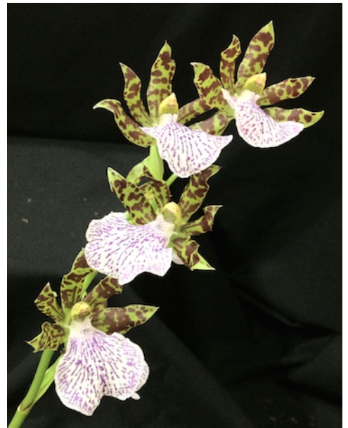
Zygopetalum mackaii (Dana Mitchell)