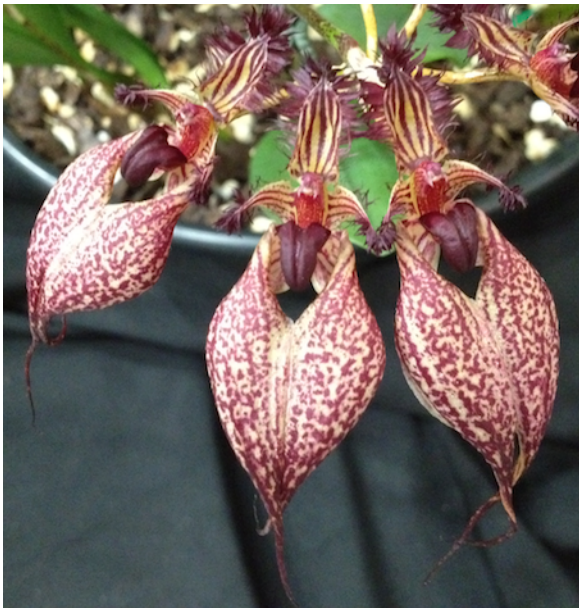
Bulbophyllum rothschildianum (Maxine Godbeer)

Some interesting species orchids from our Autumn Show: