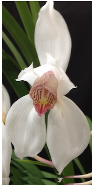
Cymbidium erythrostylum