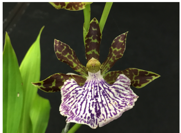
Zygopetalum intermedium x self (Ian Duncan) Best Species