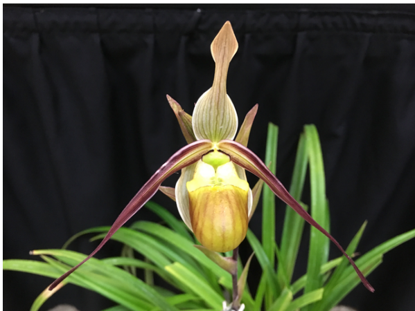
Phragmipedium conchiferum (George Price) Best any other genera