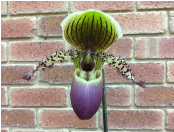
Paphiopedilum Translie "Rock and Roll" (Howard Tan) Grand Champion