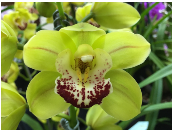
Cymbidium One Tree Hill "Waikanae Canary" (Courtney Rogasch) Best Cymbidium