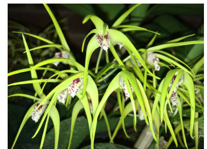
Dendrobium Hilda Poxon