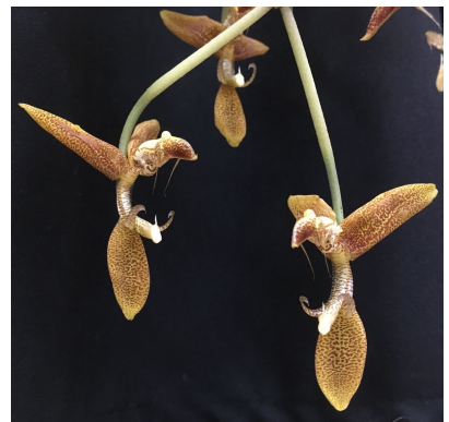
Gongora gratulabunda