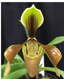
Paphiopedilum villosum (Rod Pohl)