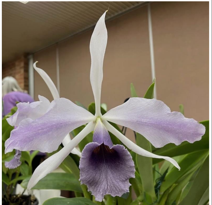
Novice Popular Vote

Cattleya CG Roebling 'Blue Indigo' x Cattleya gaskelliana x Cattleya pupurata . (Lynn Brooks)