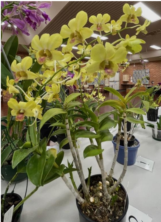
Open Popular Vote