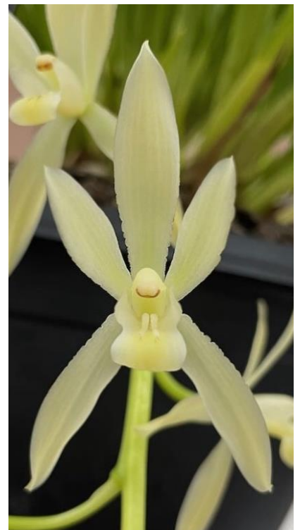
Photo at right: Best Cymbidium of the night, Cymbidium dayanum alba , grown by Helen Stretch.