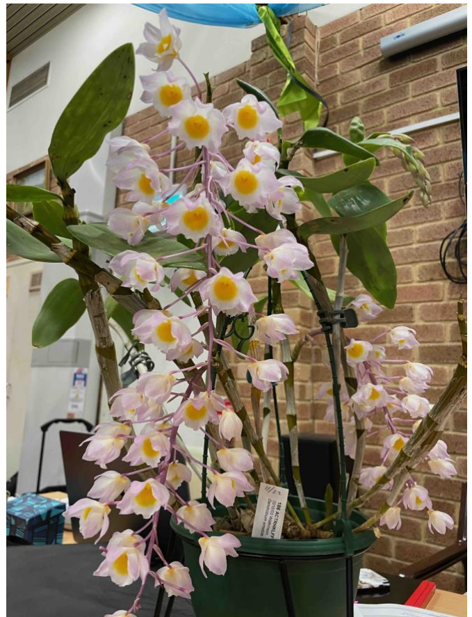
Winner of the Open Popular Vote Dendrobium amabile Grown by Tara Peeters.