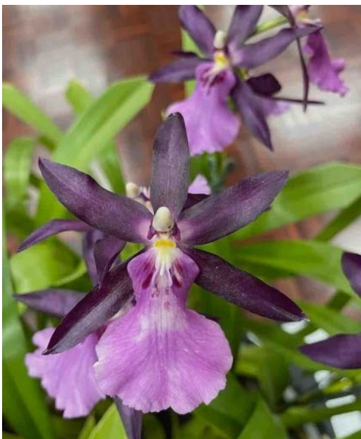
Open Popular Vote Miltonia x bluntii Grown by Courtney Rogasch