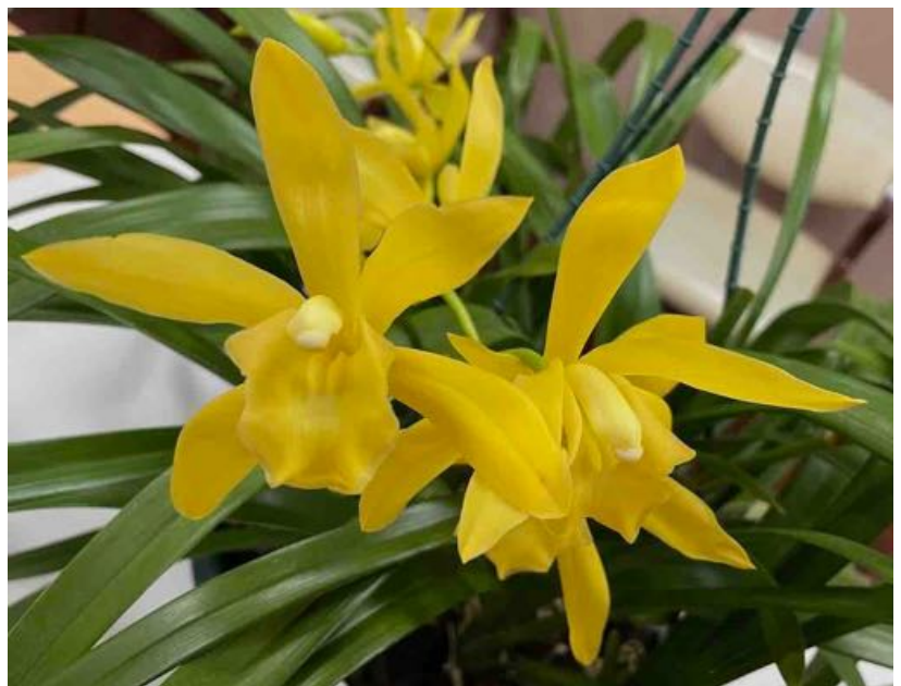
Novice Popular Vote Cymbidium Yellow Elf Grown by Lynn Brooks