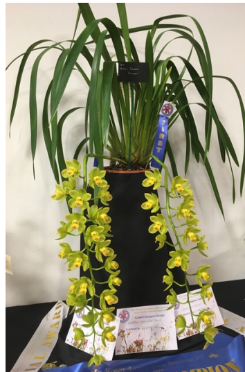
Cymbidium Lemon Sorbet "Dancer" (Grand Champion, Best Seedling, Best Cymbidium — Ezi-Gro Orchids)