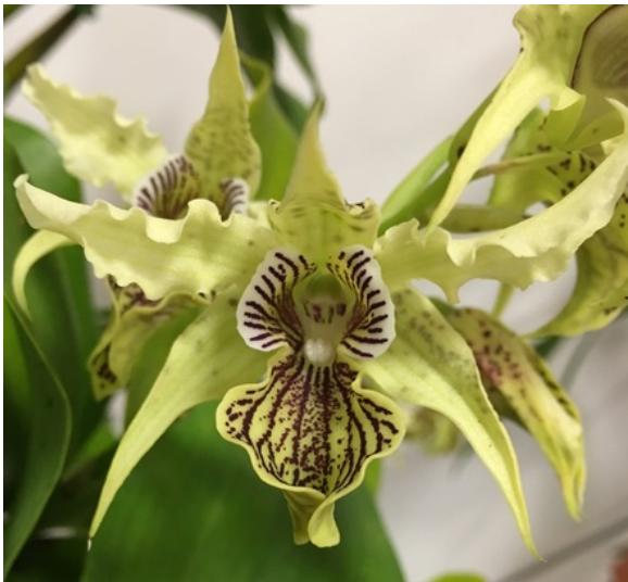
Dendrobium alexandrae x Dendrobium forbesii (Best Dendrobium — Rosemary McGrath)