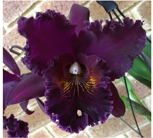
Brassolaeliocattleya Chia Lin 'New City', grown by Jack Krishnan

Flowering plants should also be closely observed for caterpillars and thrips that will damage them if left untreated. Also make sure you have baits spread around to neutralize the snails and slugs that appear with the rain. When watering, choose a day forecasted to be sunny. A sunny day will allow the plants to dry out by nightfall and ensure no water remains in the leaf axils, which could induce rot. It is also probably wise to wait until the sun is shining into your garden before watering, as by then the water in the pipes may have warmed up to some degree. Avoid all potting activities, unless not doing so might kill the plant.