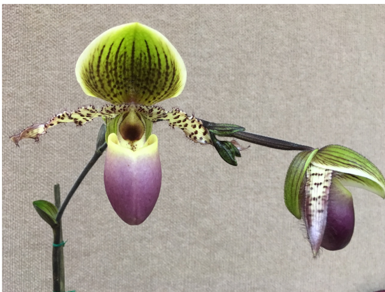
Paphiopedilum Translie (left) and Paphiopedilum gratrixianum (below), both grown by Howard Tan.

At this time of the year, most growers do not water plants overhead due to the possibility of marking the flowers. It is sound practice to carefully hand-water, if time permits. I do water overhead, but after watering I ensure the pouch is emptied of water and excess water is not left on the remainder of the plant. This can easily be achieved by gently tapping the flower.