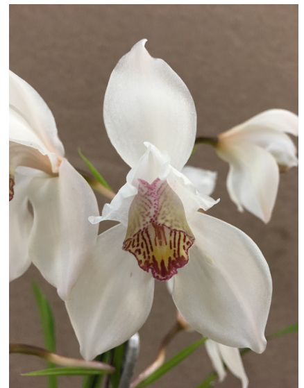
Cymbidium erythrostylum , grown by Courtney Rogasch.

During July we can expect cold, wet wintry weather. Fertilising can be tapered off to once a fortnight. Watering will also depend on the weather, but don't allow the pots to become dry, particularly those in spike and under cover. Keep the flowering house and shade houses well baited with slug and snail pellets, particularly now that the flower buds are showing.