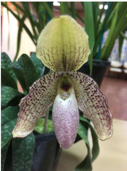
Paphiopedilum Rowenna, from the April meeting. Grown by Rod Pohl.