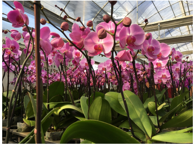
There were thousands of phalaenopsis hybrids in flower at Tropical Colours Nursery.