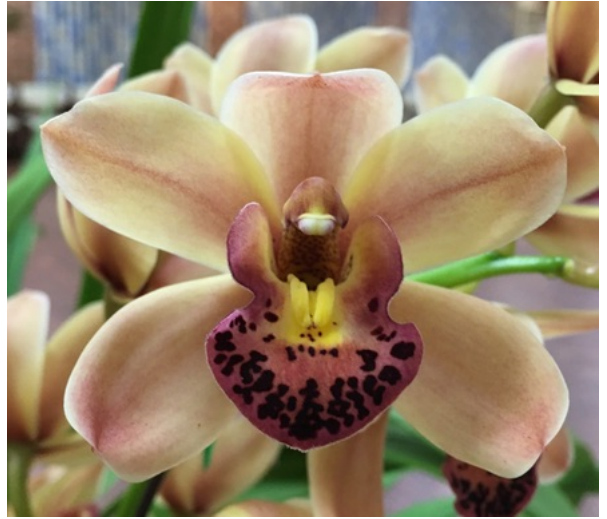
Cymbidium pumilum x Cymbidium Wallara "Golden Nugget", grown by Barbara Burnett

We are now entering into the Spring months when we see the majority of our Cymbidiums flowering once again. Also these are the months when the orchid societies hold their annual Spring Shows, so give your plants that are in spike that little extra care and attention, then enter them into the shows so that everyone can enjoy them with you. I should start off this month with a few hints on preparing your plants for exhibition. Firstly, give the pots a good clean up. Next, wipe the leaves over with a clean, damp, soft cloth. Trim the ends of the leaves, some may have dead tips and these can look rather unsightly. Always remember to sterilize the cutting instrument after attending to each plant. Then, probably the most important point, make sure that those plants that need it are properly staked, so presenting their flowers in a proper manner. It doesn't really take long to prepare each plant for a show, but it does make all the difference to the finished product. Finally, on the morning of the day that the Show is to be set up, give your plants a good water as they may have to be on display for 3 or 4 days. You should already be hard at it with dividing and repotting by now, and by doing each plant in turn after it has flowered, it will save a lot of last minute, hurried work at the end of October.