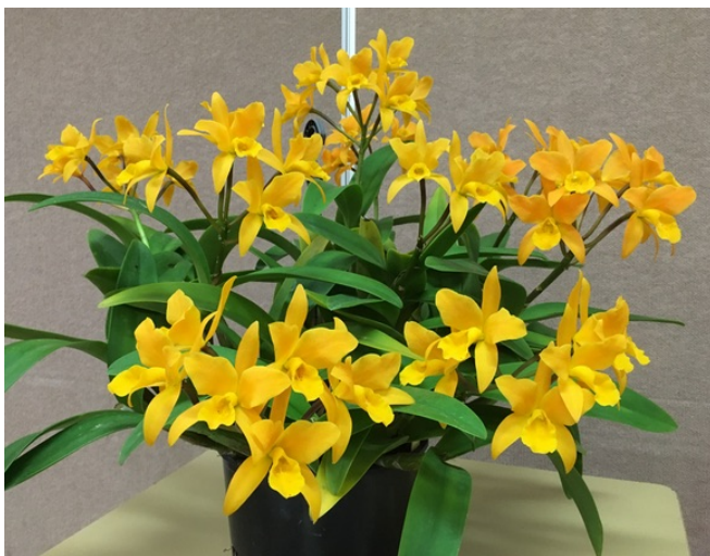
Rhyncholaeliocattleya (Haadyai Delight x Srisil Gold), grown by Valerie Cooper. Valerie grows this orchid under 50% shadecloth, with protection from the winter rains, and fertilises it with Strike Back for Orchids Liquid and pellets.

there is a viable bud at the point of division. If none is found, do not divide it at that point but seek another spot. When potting on a Cattleya it is worth choosing a mix that will be adaptable to the time you can give to watering your plants. If frequent watering is possible, a coarser, less absorbent mix can be used, while those people who cannot spare enough time to water the plants should use a smaller sized mix which will hold water for longer. Cattleyas like a wet to nearly dry cycle for best growth. Use a pot size you feel will be adequate to allow at least 2-3 years growth before the need for repotting arises. Do not over-pot. When repotting, hold the plant so that the oldest bulb sits plumb with the back edge of the pot, giving the new growth at least 2 years of growth in front. After filling the pot with your mix, the plant should be anchored firmly enough for you to lift it up by the leaves without separating it from the pot. A stake alongside the foremost growth to which it is tied is also worth considering if there is any doubt