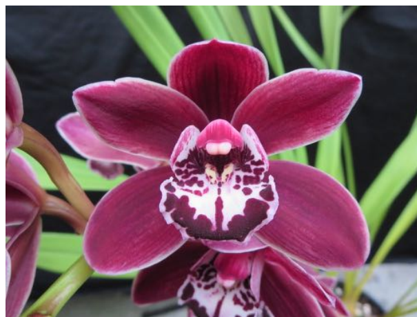
Cymbidium Willunga Regal 4n seedling