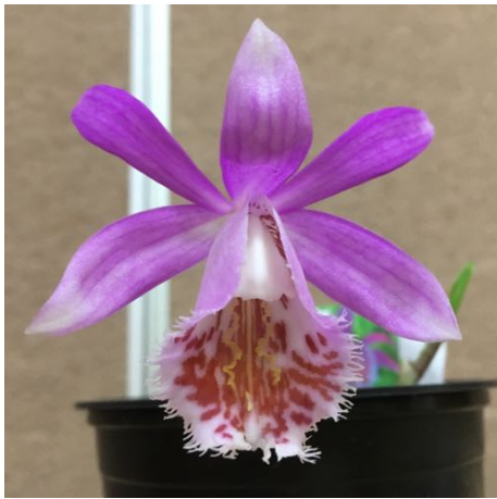
Pleione Versailles Buckleberry (Lynn Brooks) This plant was display-only.