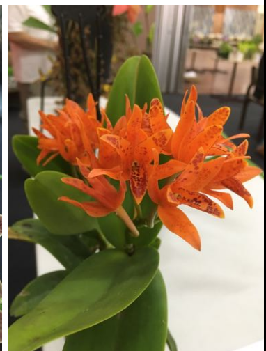
Guarianthe aurantiaca