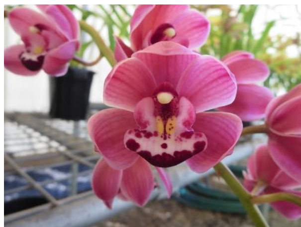
Cymbidium Toltrice 4n seedling #2