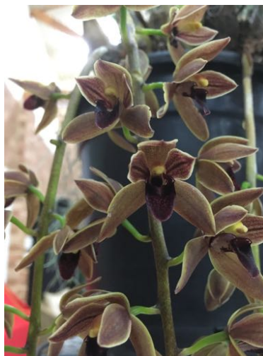
Cymbidium Cricket (Jacqui Bateman)