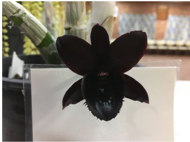
Fredclarkeara After Dark 'SVO Black Pearl' FCC (Ian Duncan). It's not just a bad photo, the flower is really dark.