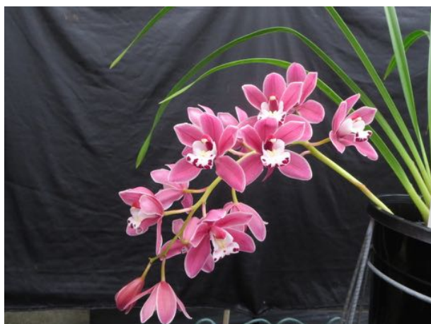
Cymbidium Toltrice 4n seedling