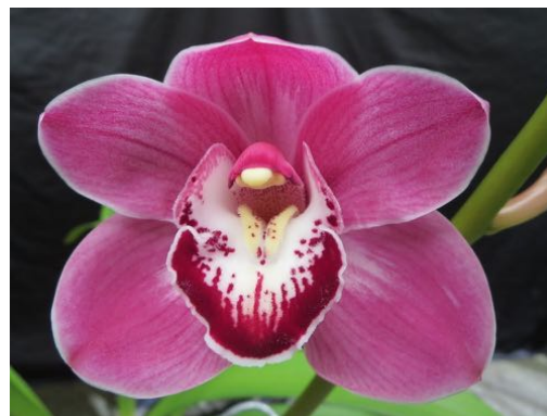
Cymbidium Coastline 4n seedling