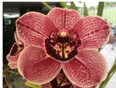
Cymbidium Hit the Spot