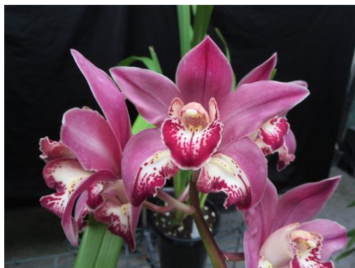
Cymbidium (Khan Flame x Butterfly Magic) 4n seedling