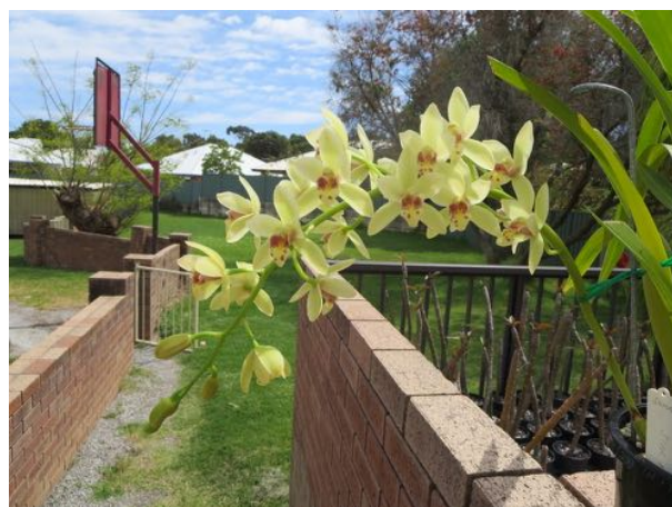
Cymbidium Star Falls 4n seedling