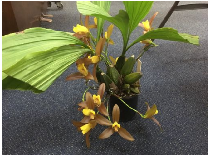
Lycaste lasioglossa (Trevor Burnett)