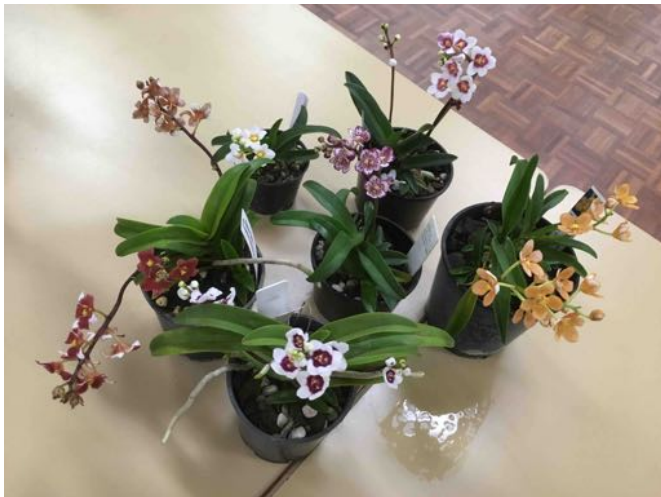
Tara spoke about the variety of Sarcochilus orchids