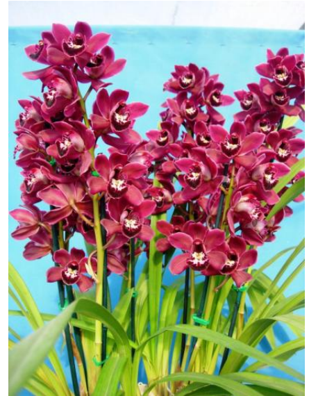
Cymbidium Memoria Dora Price 'Rosalie'