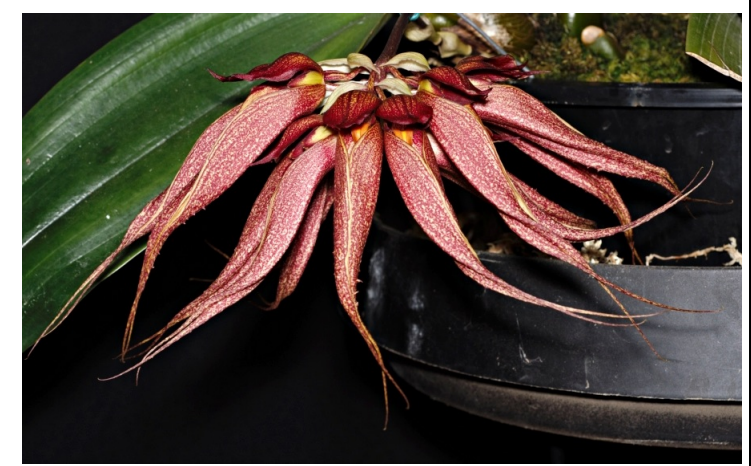
Bulbophyllum Krairit Vejvarut 'Gerda'.