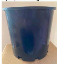
Cym pots - large