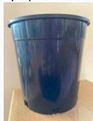
Cym pots - medium