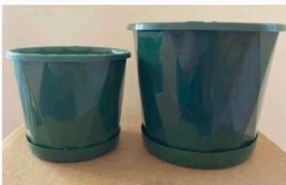
Green pots with saucer included