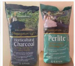
Charcoal and Perlite