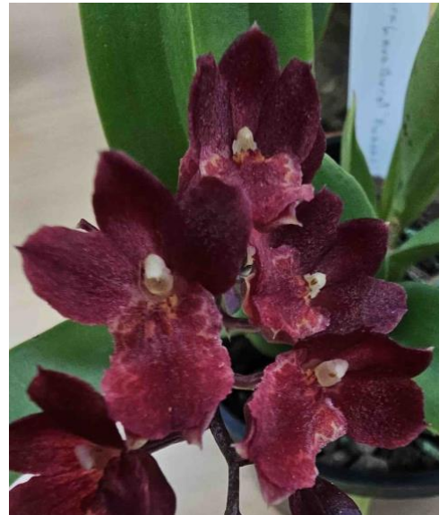
Howeara Lava Burst 'Puanani' AM/AOS (Joshua Balgos)