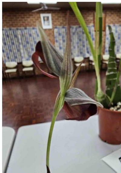
Serapias olbia (Tara Peeters)