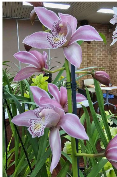
Cymbidium insigne 'Atlantis Pink' (Helen Stretch)