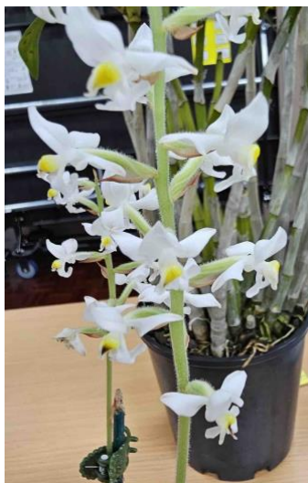
Ludisia discolor