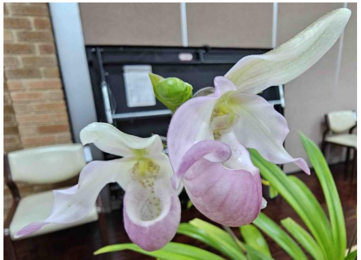
Phragmipedium Sedenii 'Candidum'