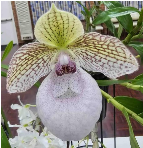
Paphiopedilum fanaticum ( malipoense x micranthum ) (Howard Tan)