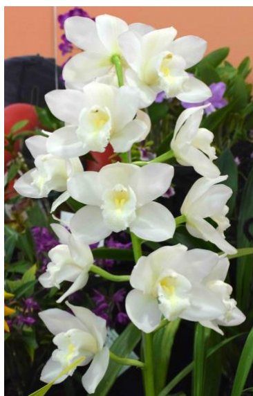
Cymbidium St Ives (Courtney Rogasch)