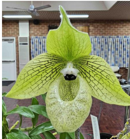
Paphiopedilum malipoense (Howard Tan)