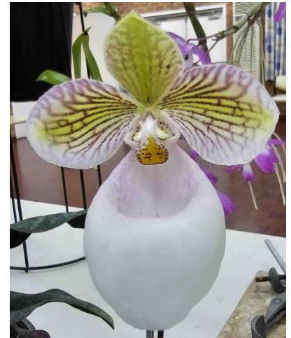
Paphiopedilum micranthum var. eburneum (Howard Tan)