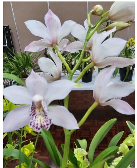
Cymbidium insigne (white) (Helen Stretch)