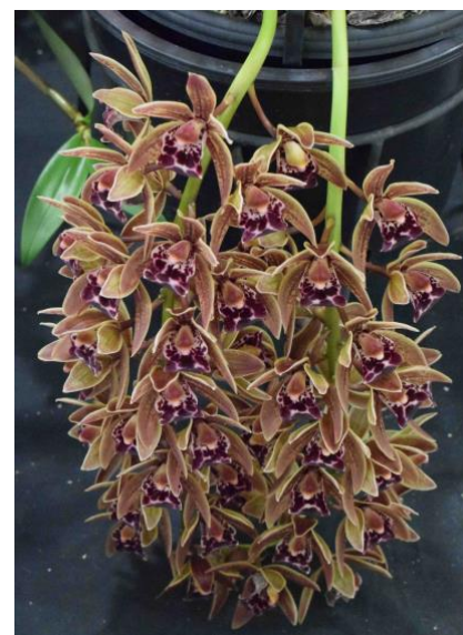
Cym (Tethy's x Miss Muffet 'Spots')