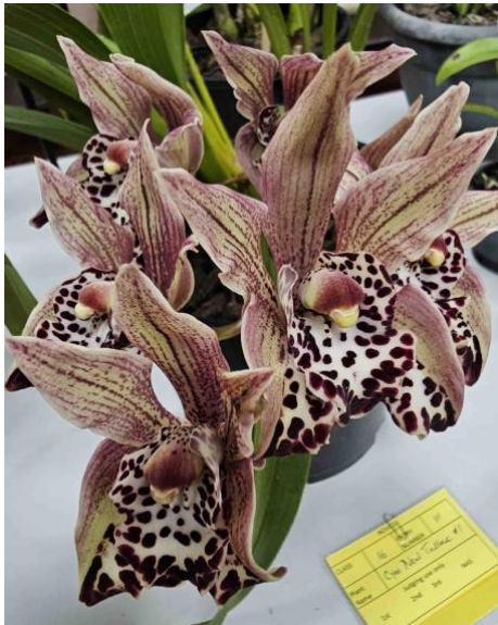
Cymbidium Neil Tadlock '#1' (Keng Leow)