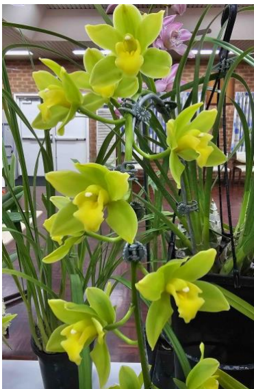
Cymbidium Bellissimo (Courtney Rogasch)