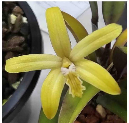
Cattleya blumenscheinii