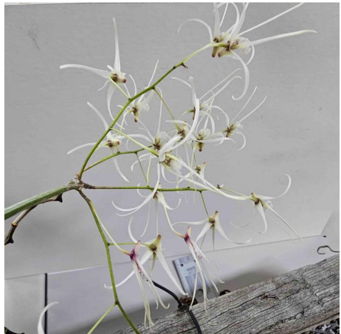
Dendrobium teretifolium , grown by Alan Rowe.